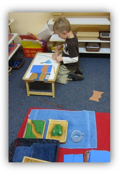
Continued on the next page